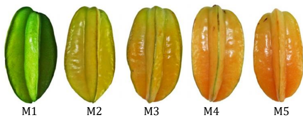
Figure 1: Different maturity stages of carambola fruit.

method following the protocol of Nayab et al. (2020) and expressed in % oxalic acid. Ripening index (TSS/TA) was calculated by dividing TSS of samples with their respective TA. Ascorbic acid content in juice samples was determined by using the method previously adopted by Naz et al. (2014).